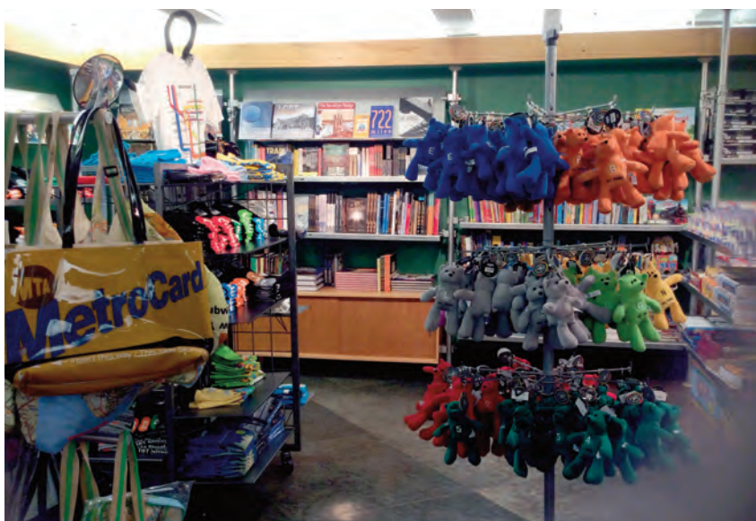
Transit Museum Store

If I want to get a sensory kit with quiet headphones and checklist with pictures, I can go to the Museum store and pick it up.